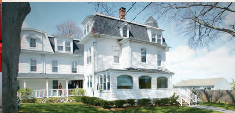
Thames Academy (above) is located on the waterfront campus of Mitchell College. The College's renowned academic support programs include the nationally recognized Bentsen Learning Center for students with documented learning disabilities and/or ADHD.